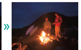
Conventional digital camera